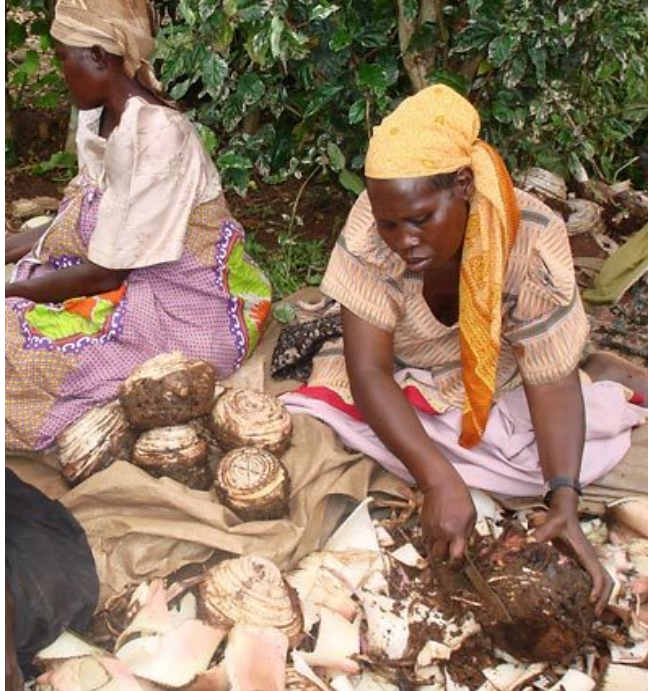
Third World Development: Capacity Building