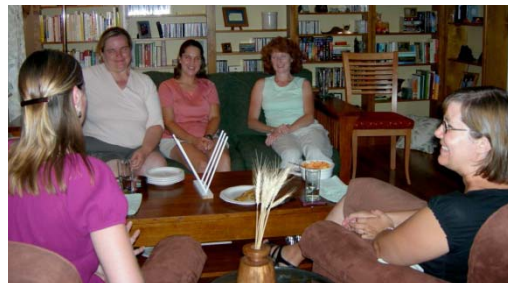
Consumers: My and my families' health and well-being