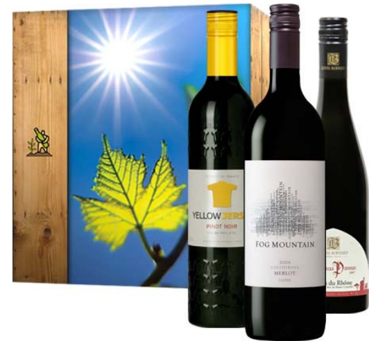
Eco Wine Trio - $29.99 10% retail price to EarthERA Trust