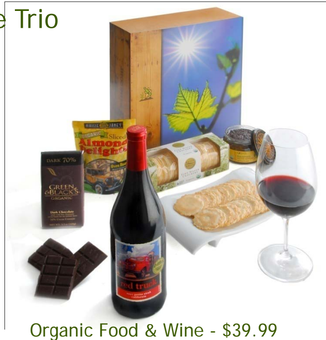
Organic Food & Wine - $39.99